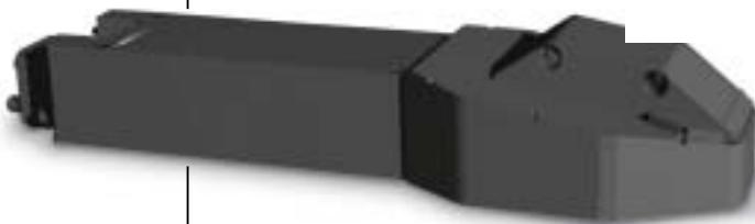
Laser head, combined with integrated cutting and marking head