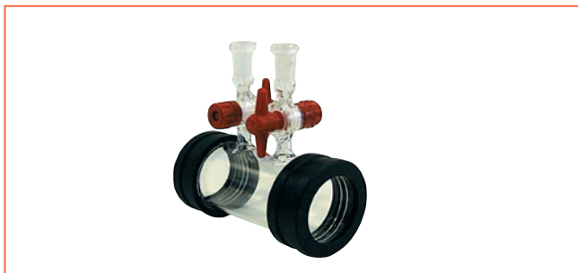
Pyrex Gas Cell