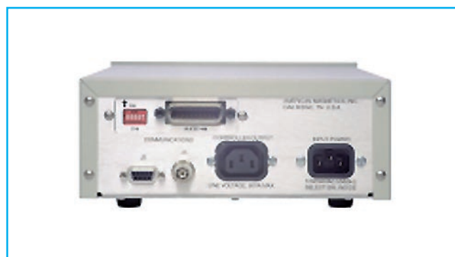
Rear view of Model 186 with IEEE-488 option installed.

The instrument is equipped with a 4-digit LED display which provides liquid level indication in inches, centimeters, or percent as selected by a front panel switch. A front panel switch allows the user to adjust the instrument's length setting quickly and easily for a specific active sensor length. The sensor active length can be entered in either inches or centimeters.